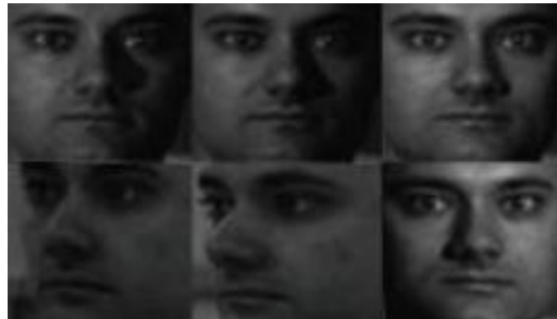
Figure 3. Partial Face Images of 3 Sub Sets of CMU-PIE Library