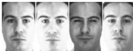
Figure 4. Face Images of 2 Sub Sets of AR Library